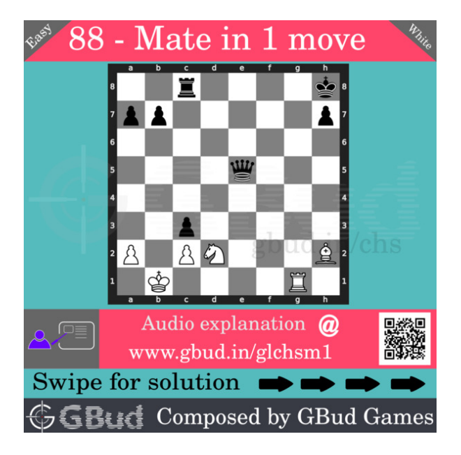
Figure 7: easy chess puzzle 88 chart 3