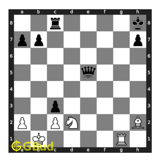
Figure 3: Initial board position of easy chess puzzle 0088

Initial board position This is the initial board position of easy chess puzzle 0088.