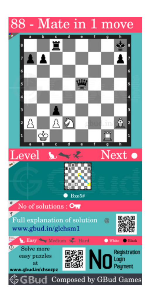
Figure 6: easy chess puzzle 88 chart 2