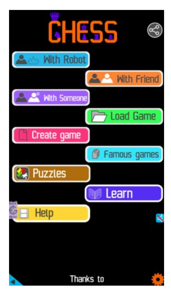
Figure 13: Play chess online for free. Solve puzzles and play with friends

Play chess for free at https://gbud.in/chs