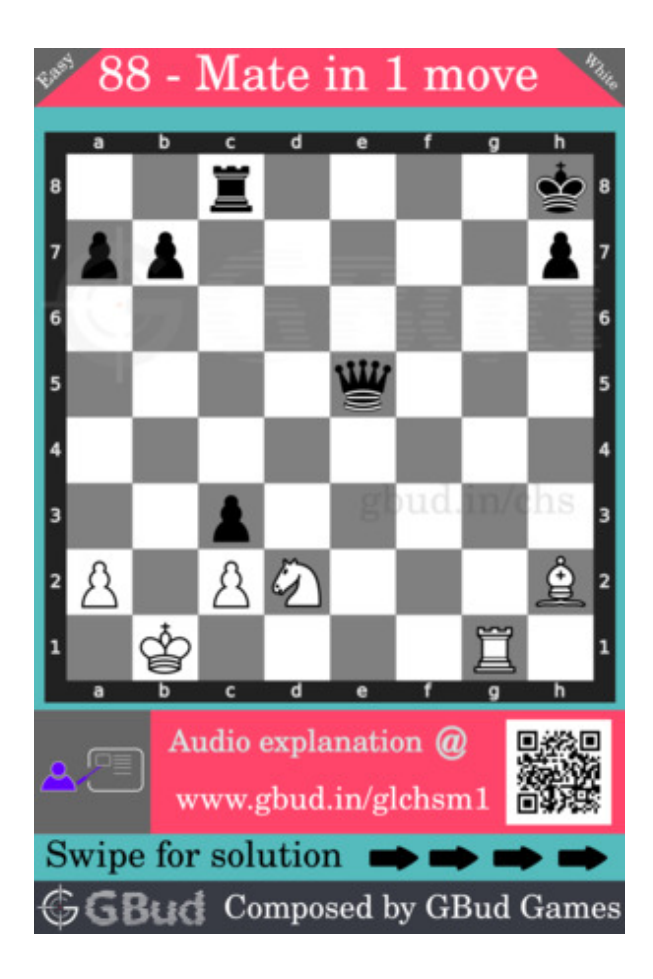
Figure 5: easy chess puzzle 88 chart 1